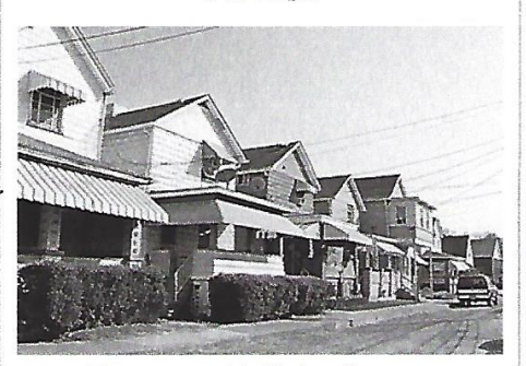
Houses on McKinley Avenue